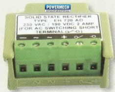
Mounting Dimension : 44.3 mm