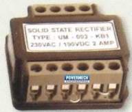
Mounting Dimension : 29.4 mm